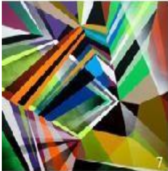
Figure 7 demonstrates a crystal formed by crystallization that is a process by which a chemical is converted from a liquid solution into a solid crystalline state.

Figure 6 presents the old water pump to create the process of fluid flow.