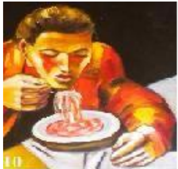
Figure 10 demonstrates the process of mass transfer defined as the net movement of mass from one location to another.

Figure 9 demonstrates the process of drying by a towel that is a piece of absorbent fabric used for drying or wiping. Drying is defined as a mass transfer process consisting of the removal of water or another solvent from a wet body.