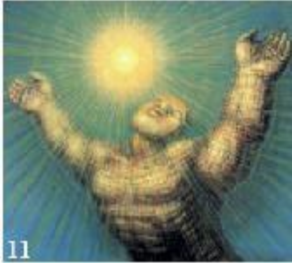
Figure 11 demonstrates the process of heat transfer that is the energy in transit due to temperature difference.