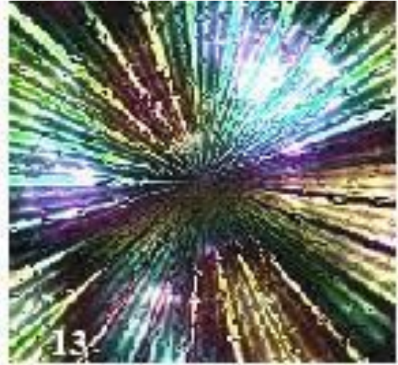
Figure 13 demonstrates the process of radiation that is energy coming from a source and travels through some material or through space. In conclusion the authors believe that the artistic demonstration of the different engineering processes makes them clearer and easy to perception.

Figure 12 demonstrates the cooling process by a picture of Global cooling. Cooling process is defined as the operation in which heat is removed from a system by evaporation of liquids, expansion of gases, radiation or heat exchange to a cooler fluid stream, and so on.