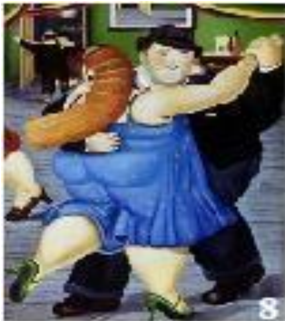
Figure 8 demonstrates the process of doing work where work is the measure of a quantity that is capable of accomplishing macroscopic motion of a system due to the

Figure 7 demonstrates a crystal formed by crystallization that is a process by which a chemical is converted from a liquid solution into a solid crystalline state.