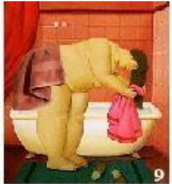
Figure 9 demonstrates the process of drying by a towel that is a piece of absorbent fabric used for drying or wiping. Drying is defined as a mass transfer process consisting of the removal of water or another solvent from a wet body.

action of a force over a distance. Here the system is the dancing couple.